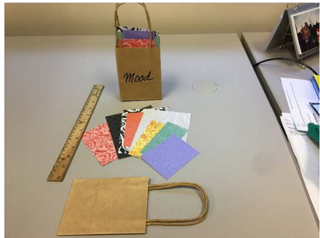
Example combinations and materials | Edmonds School District