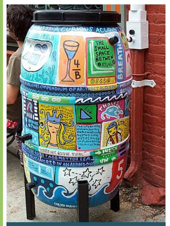
Rain barrel in use in the City of Lancaster

Cisterns and rain barrels can be used in urbanized areas where the need for supplemental onsite irrigation or other high water uses is especially apparent.