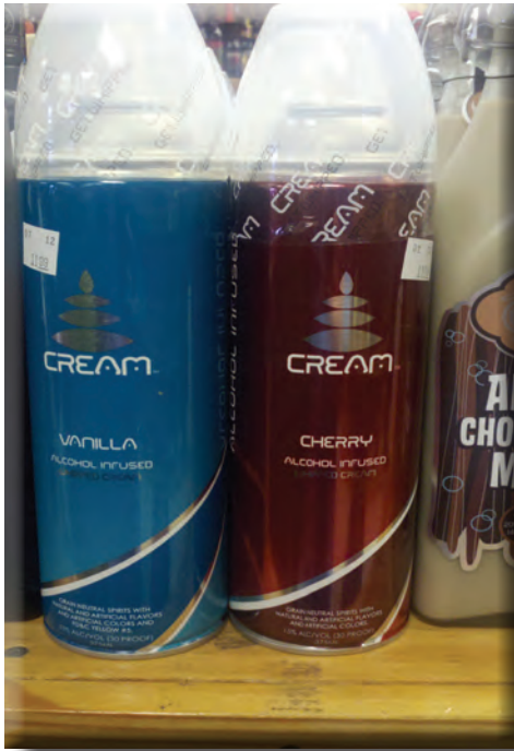
ALCOHOL INFUSED WHIPPED CREAM