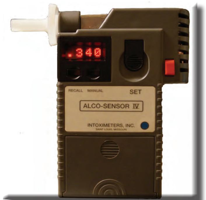
FIELD OPERATED BREATH SENSOR FOR ALCOHOL