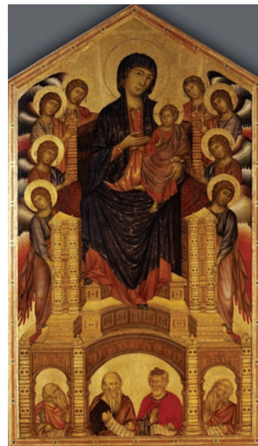
Figure 2.7 | The Virgin Mary featured in a panel from an altarpiece painted by Cimabue around 1280

Throughout the Middle Ages, Mary the mother of Jesus, referred to as the Virgin Mary, was a central figure in Catholic devotion and worship. Under Catholic belief, she is upheld as the perfect woman, having been chosen by God to miraculously give birth to the Christ while still a virgin. She was given the role of intercessor, a mediator for the Christian believer with a petition for God, and as such appeared in many medieval chants.