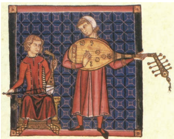
Figure 2.10 | Rebec and Lute Players depicted in Cantigas de Santa Maria

Many songs that merge these two focus points appear in a late thirteenth-century manuscript called the Cantigas de Santa Maria (Songs for the Virgin Mary), a collection sponsored by King Alfonso the Wise who ruled the northwestern corner of the Iberian peninsula. Cantigas de Santa Maria also includes many illustrations of individuals playing instruments. The musician on the left in Figure 2.10 is playing a rebec and the one to the right a lute. Elsewhere in the manuscript these drummers and fifers appear (see Figure 2.11). These depictions suggest to us that, outside of worship services, much vocal music was accompanied by instru-