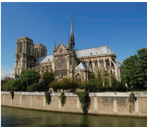
Figure 2.3 | Notre-Dame de Paris

Many of the important historical developments of the Middle Ages arose from either in the church or the court. One such important development stemming from the Catholic Church would be the developments of architecture. During this period, architects built increasingly tall and imposing cathedrals for worship through the technological innovations of pointed arches, flying buttresses, and large cut glass windows. This new architectural style was referred to as "gothic," which vastly contrast the Romanesque style, with its rounded arches and smaller windows. Another important development stemming from the courts occurred in the arts. Poets and musicians, attached to the courts, wrote poetry, literature, and music,