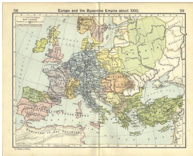
Figure 2.2 | Map of Western Europe