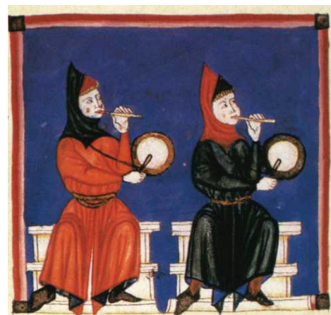
Figure 2.11 | Drummers and fifers depicted in Cantigas de Santa Maria