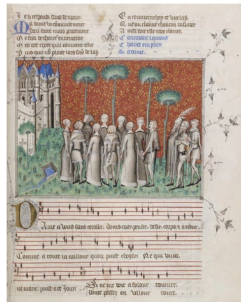
Figure 2.6 | Group of people dancing depicted in Machaut’s manuscript

As we study a few compositions from the Middle Ages, we will see the following musical developments at play: (1) the development of musical texture from monophony to polyphony, and (2) the shift from mu-