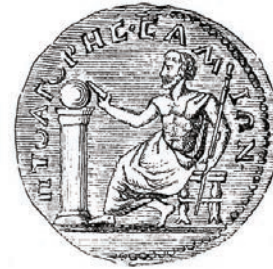
Figure 2.1 | Profile of Pythagoras on ancient coin

Pythagoras might be thought of as a father of the modern study of acoustics due to his experimentation with bars of iron and strings of different lengths. Images of people singing and playing instruments, such as those found on the Greek vases provide evidence that music was used for ancient theater, dance, and worship. The Greek word musicka referred to not music but also referred to poetry and the telling of history. Writings of Plato and Aristotle referred to music as a form of ethos (an appeal to ethics). As the Roman Empire expanded across