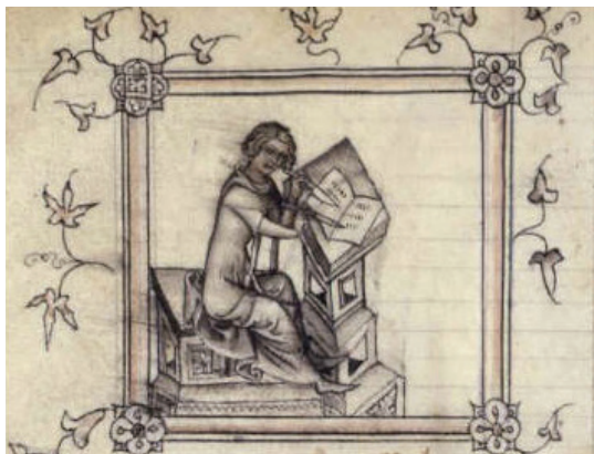
Figure 2.9 | Depiction of Guillaume de Machaut

Composers wrote polyphony so that the cadences , or ends of musical phrases and sections, resolved to simultaneously sounding perfect intervals. Perfect intervals are the intervals of fourths, fifths, and octaves. Such intervals are called perfect because they are the first intervals derived from the overtone series (see chapter one). As hollow and even disturbing as perfect intervals can sound to our modern ears, the Middle Ages used them in church partly because they believed that what was perfect was more appropriate for the worship of God than the imperfect.