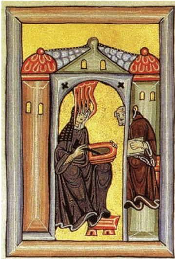
Figure 2.8 | Depiction of Hildegard of Bingen in the Rupertsberger Codex of her Liber Scivias

Many composers of the Middle Ages will forever remain anonymous. Hildegard of Bingen (1098-1179) from the German Rhineland is a notable exception. At the age of fourteen, Hildegard's family gave her to the Catholic Church where she studied Latin and theology at the local monastery. Known for her religious visions, Hildegard eventually became an influential religious leader, artist, poet, scientist, and musician. She would go on to found three convents and become an abbess, the chief administrator of an abbey.