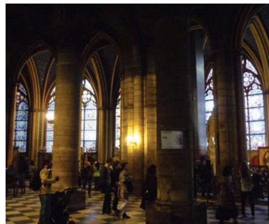
Figure 2.4 | The ambulatory of Notre Dame