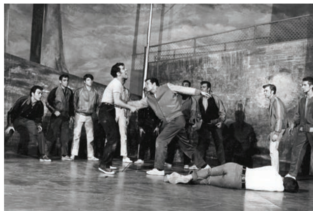
Figure 8.14 | West Side Story

One precursor to modern musical theatre is the minstrel show . The first distinctly American form of theatre, minstrelsy was developed in the nineteenth century and featured white performers in blackface performing in a variety show of sorts. These three-act shows featured stock characters singing songs, performing in skits, and telling jokes. They often depicted black characters as happy participants in romanticized versions of the