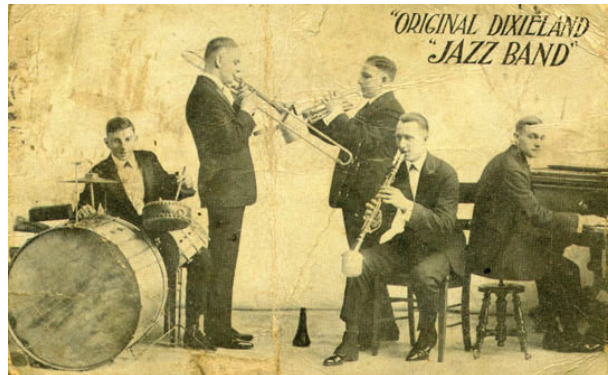
Figure 8.5 | Original Dixieland Jazz Band

Charles “Buddy” Bolden is widely recognized as the first major figure in the early development of jazz in NOLA. Bolden, like most of the other top jazz performers at that time, was of African descent, a fact which points to the central importance of African Americans to the development of New Orleans jazz and later American popular music from this point forward. Unfortunately, no known recordings of Bolden exist. The Original Dixieland Jazz Band, an ensemble comprised of white musicians, is widely considered to have made the first recording of jazz. This recording sold over one million copies in the first six months of its release and did much to associate New Orleans with “jazz” in the new recording industry. Phonograph records soon replaced sheet music as a favorite way to experience new music because records allowed the listener to hear the subtle jazz performance practices that could not be accurately put down on paper.