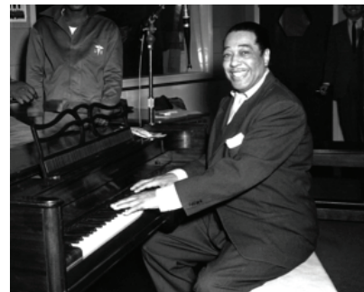
Figure 8.6 | Duke Ellington

By the 1930s, jazz was the most popular music in the country. Most jazz ensembles at this time featured a large group of fifteen to twenty musicians. This increase in size was needed mainly because the larger venues used for dancing made it difficult to hear small combos over the noises in the room. Before long, the standard instrumentation of the performing dance band had become five saxophones, five trombones, five trumpets, a rhythm section (piano, bass, and drum set), and oftentimes one or more singers. The larger number of instruments made the normal improvised Dixieland parts impractical; fifteen musicians improvising at the same time just sounded like noise. Therefore, band leaders began to either arrange parts for the different sections (as Duke Ellington did) or hire arrangers to do it for them (as did Glenn Miller, Stan Kenton, and others). The standard big band instrumentation that resulted survives to this day.