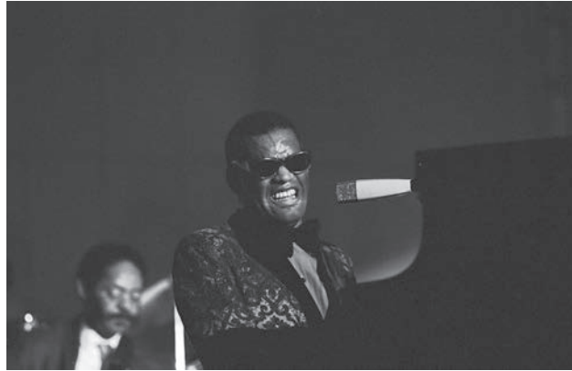
Figure 8.8 | Ray Charles

The term “ rhythm and blues (R&B) ” was first used by Billboard magazine in 1948 to refer to music recorded by black musicians and intended for use by the African American community. It has changed definitions several times over the years and is now very much in the mainstream. At one point, the term encapsulated several different musical styles, including soul and funk. Early rhythm and blues ensembles