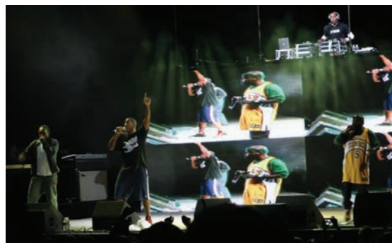
Figure 8.11 | A Tribe Called Quest

By the 1990s, rap had evolved into a more sophisticated musical style featuring complex rhythms and clever wordplay. The instrumentation of rap music varies greatly depending on the artist and, often, the individual song. Early rap concerts featured DJs creating beats on turntables , which allowed the DJ to create music on the spot by playing and manipulating records. One well-known technique on the turntables is scratching , or improvising a rhythmic solo on one turntable over a beat.