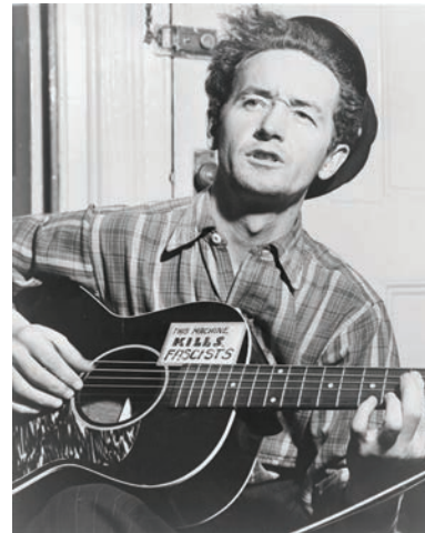
Figure 8.12 | Woody Guthrie

Listen to this recording of the Scottish/English ballad “Barbara Allen.”