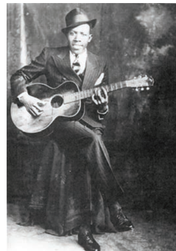
Figure 8.3 | Robert Johnson

In musical circles, the term “blues” most commonly describes a song that follows a blues form, which is a twelve-bar strophic song form. This musical structure of the blues has influenced the development of jazz, rock, techno, and other popular styles of music and is based on a few basic and recurring compositional and performance techniques. The form of the blues is repeating. It is usually eight, twelve, or sixteen bars in length, although some pieces vary this somewhat, and those sections are repeated several times. The blues uses a limited number of