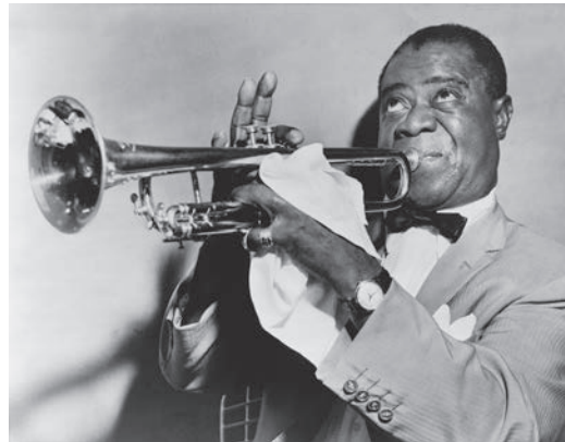
Figure 8.4 | Louis Armstrong

New Orleans jazz has its roots in Storyville, an area of New Orleans (NO-LA) known for its bars, dance halls, and brothels—like Missouri’s Chestnut Valley. In the early part of the 1900s, African American musical styles such as ragtime, blues, spirituals, and marches merged together to create a unique art form. Although jazz borrows much of its harmony and instrumentation from Europe, it differs fundamentally from European styles in its rhythmic makeup. Jazz emphasized syncopation and swing. Swing is a term used to describe the rhythmic bounce that characterizes the jazz style.