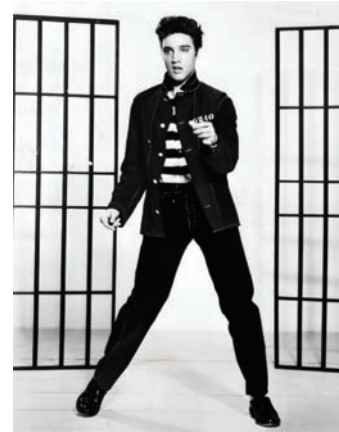
Figure 8.9 | Elvis Presley

Elvis Presley was one of the most important figures in the history of rock and roll, and one of the most celebrated recording artists of the twentieth century. He was born in Tupelo, Mississippi but grew up in Memphis, Tennessee. His recording career began in Memphis in 1954 when he worked with Sam Phillips, the owner of Sun Records. Elvis combined the sounds of country music and rhythm and blues into a style that was initially called rockabilly . Elvis soon moved to the RCA label, and his first single record “Heartbreak Hotel,” released in 1956, became the number one hit in the United States. By embracing music from both sides of the civil rights movement, Elvis became both very popular and very controversial at the same time. In many ways, he helped bring the popular music of African Americans into the mainstream of white society and paved the way for groups like the Beatles and the Rolling Stones, who were heavily