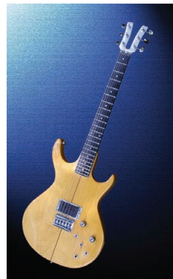
Figure 8.10 | Electric guitar, solidbody, Kramer XKG-20 circa 1980 Author | User “BellwetherToday” Source | Wikimedia Commons License | CC BY-SA 4.0