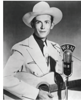
Figure 8.13 | Hank Williams Author | WSM radio Source | Wikimedia Commons License | Public Domain

Bluegrass music is a variation of country music that developed largely in the Appalachian region; it features fiddle, guitar, mandolin, bass guitar, and the five-string banjo. Often associated with Appalachia, bluegrass combines many of the song forms that are common in the region's Scottish/English musical heritage. For example, bluegrass blends the Scottish/English ballad with blues inflections. Some bluegrass songs are fast instrumental pieces featuring amazing technique by the performers. Listen to Ricky Skaggs and the Bluegrass Thunder perform via the link below.