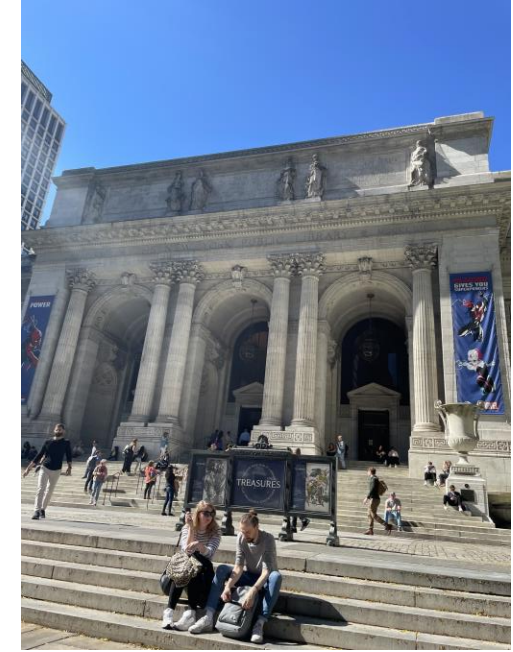
New York City Public Library

I think this symbolizes peace and light after the storm, it symbolizes peaceful institutions because of its utilization nowadays.