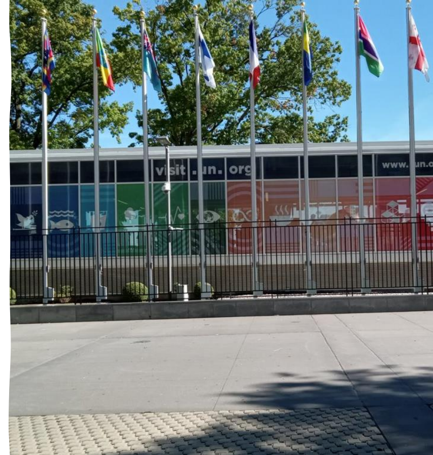
UN flags and SDG banner