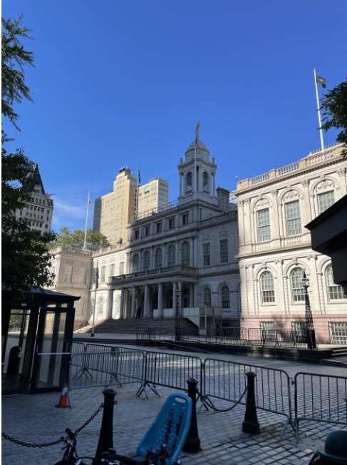
New York City Hall

It symbolizes peace because it is the headquarters of the city government, the stability of the government is a vital part of peace, the city hall commands the NYPD and all local government agencies in New York City.