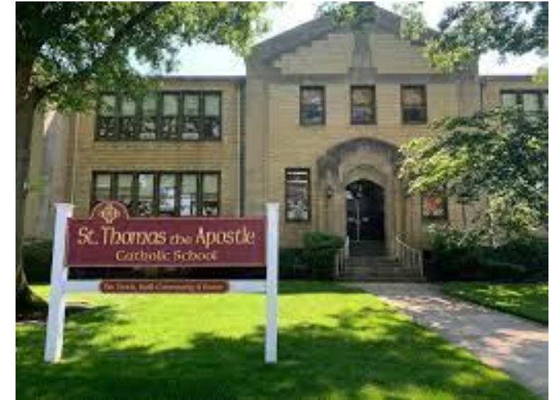
Church/ Religious buildings