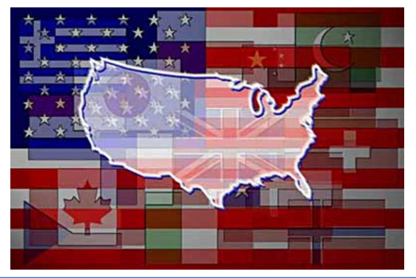
The concept of the "Great American Melting Pot" is that the American people have been created from diverse groups of immigrants forming a culture with a unique character.

The United States has long been known as a haven for immigrants — a place people come to seek a better life. However, some Americans believed and still believe that too many people are crowding the United States and that immigrants will dilute American traditions and values. Throughout American history, debates have flared among those wishing to open the borders and those wishing to close them.