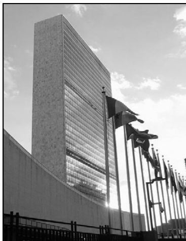
Flags outside the United Nations headquarters. Each flag represents a sovereign state.